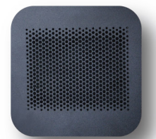
Enlarged side venting area for socket 1155/1156 platforms