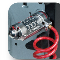
Security provision: Kensington lock