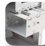
Optional detachable 2-bay 3.5" HDD cage