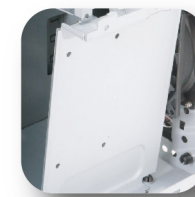
Optional one-bay bracket for 3.5" HDD

Front Control : System Reset (Bezel Dependant), IEEE 1394 (Option)